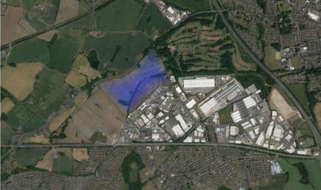
Figure 7: Area of search at land to the west of Haydock Industrial Estate and land west of Millfield Lane

3.47 Conclusion: The area of search is strategically well positioned to accommodate the growth of the freight and distribution market in the Liverpool region in the short term. It is located on the M6 distribution spine which is experiencing market demand for big shed floorspace. Any development would require the provision of local road network and supporting utilities infrastructure.