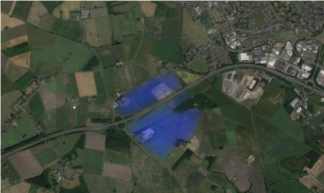
Figure 8: Area of search at Junction 3 M58