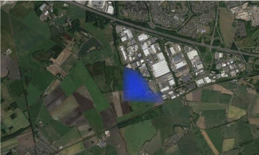
Figure 9: Area of Search South West of Pimbo Employment Area