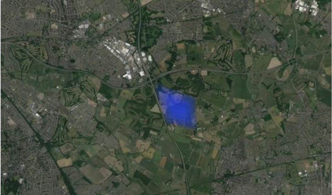
Figure 4: Area of search South of Halsnead Garden Village