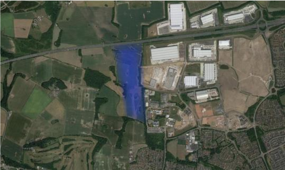
Figure 6: Area of search at Omega South Western Extension, Land north of Finches Plantation, Bold