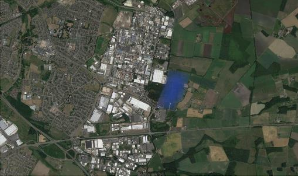
Figure 5: Area of search north of A580 at Knowsley Industrial and Business Park