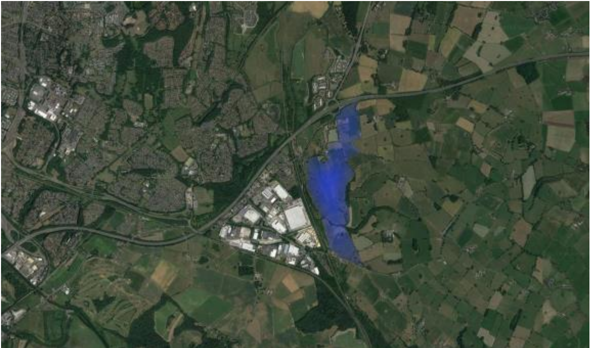
Figure 3: Area of search east of Whitehouse Industrial Estate