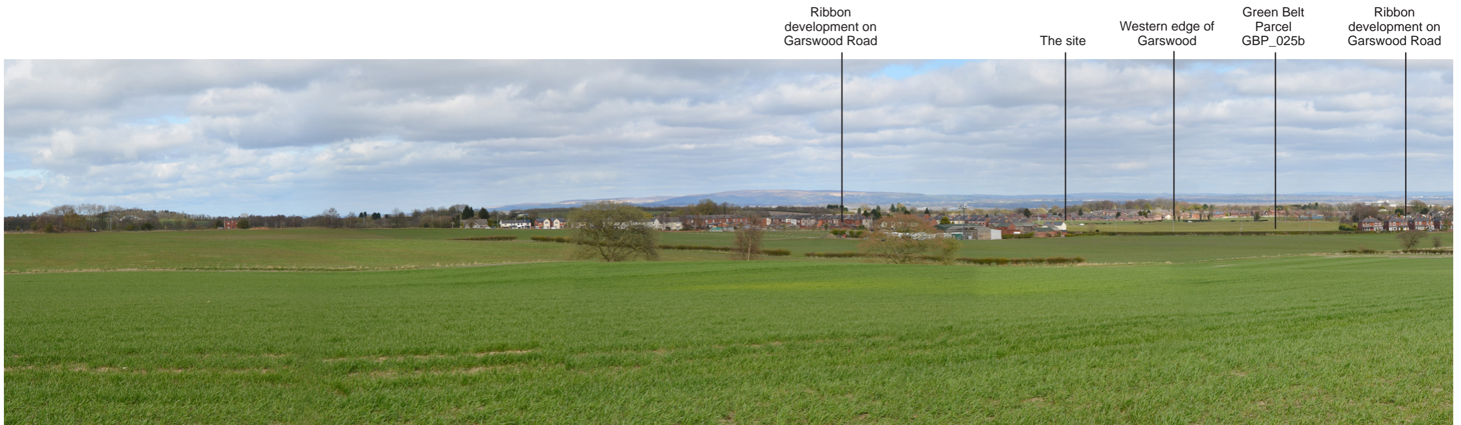
Photograph 18 - View east from the top of Weathercock Hill.