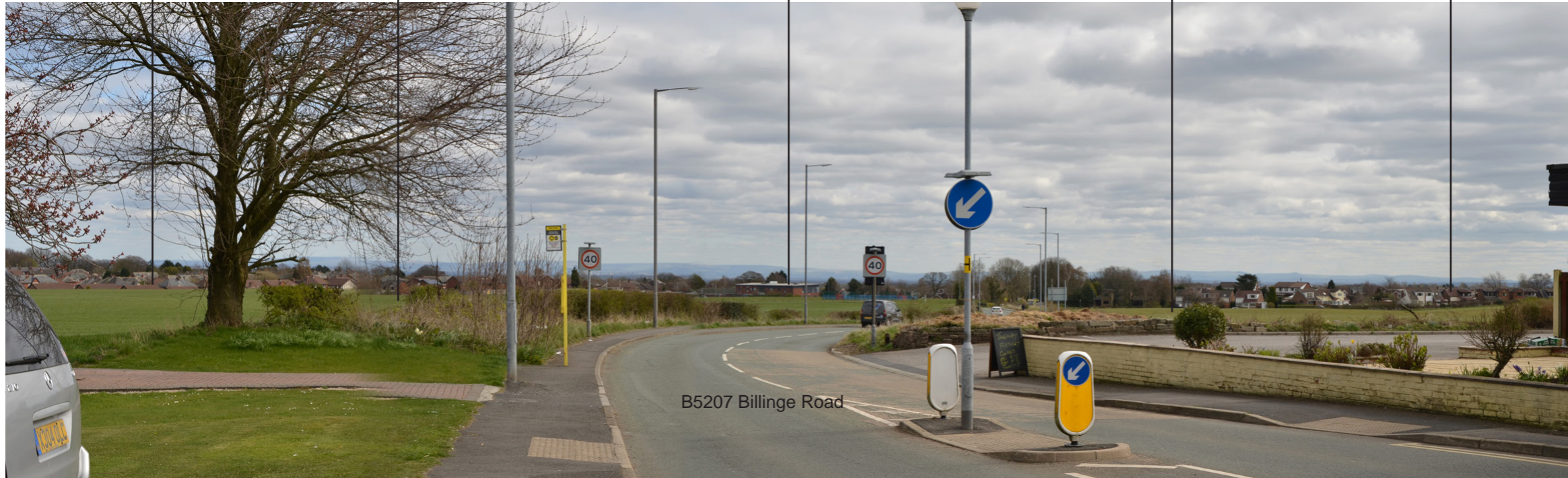
Photograph 7 - Looking west along the B5207 Billinge Road, from the crossroads with Garswood Road.