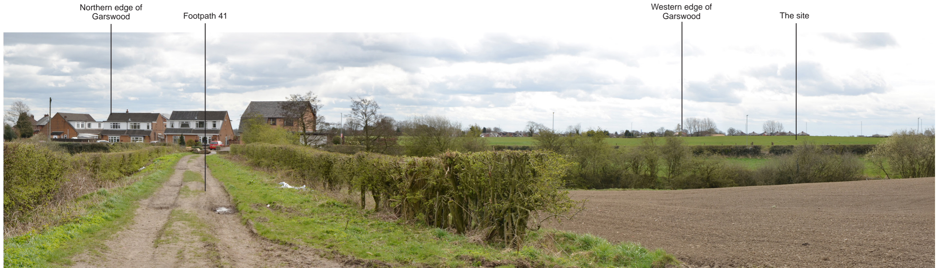
Photograph 9 - looking south-west from footpath 41 as it ascends Gladden Hey Brow