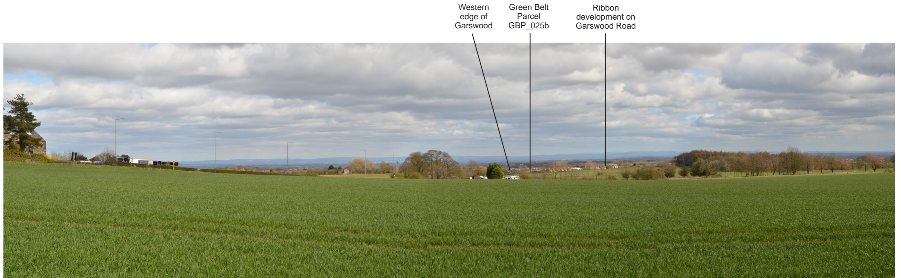
Photograph 13 - View east from footpath 93, to the east of Billinge. The site is screened from view.