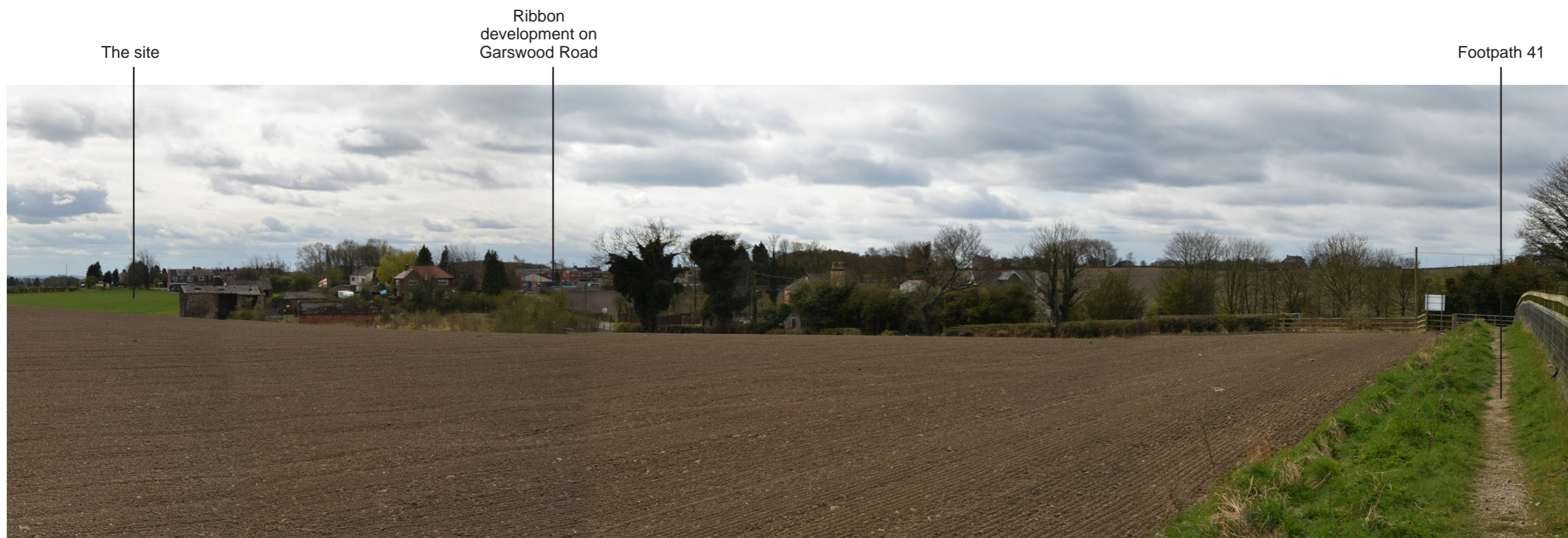
Photograph 10 continued