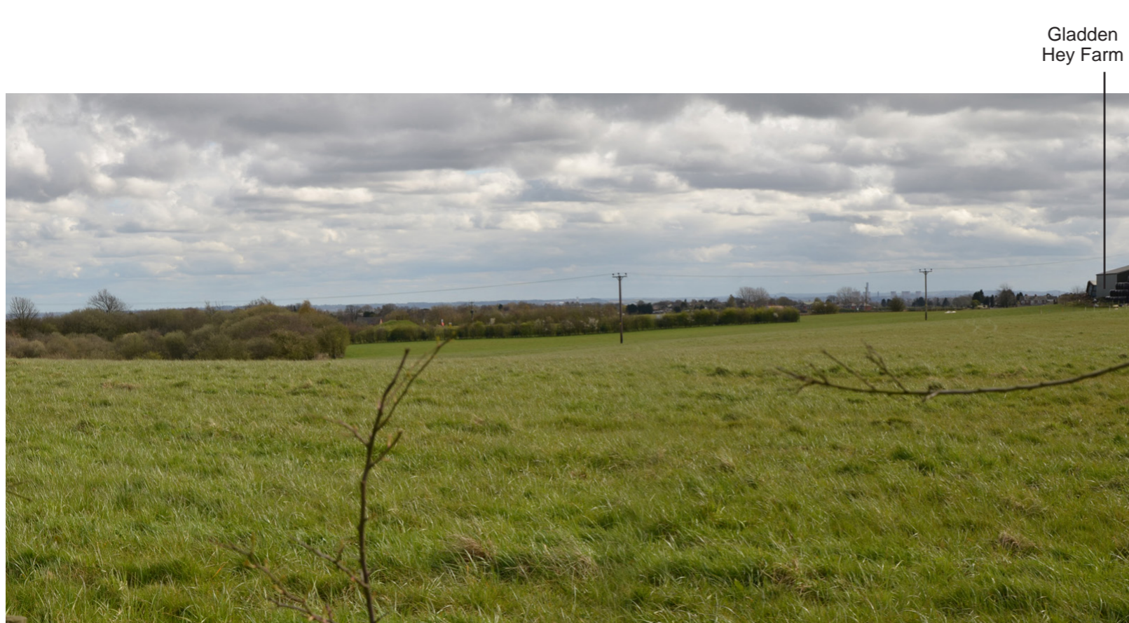
Photograph 16 - View south from footpath 58. No views of the site are possible.