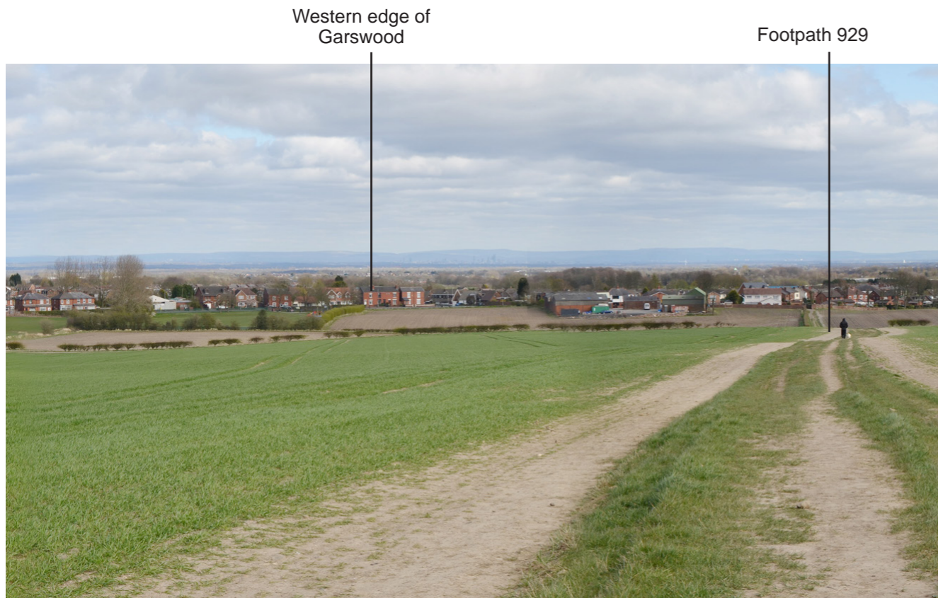
Photograph 18 continued