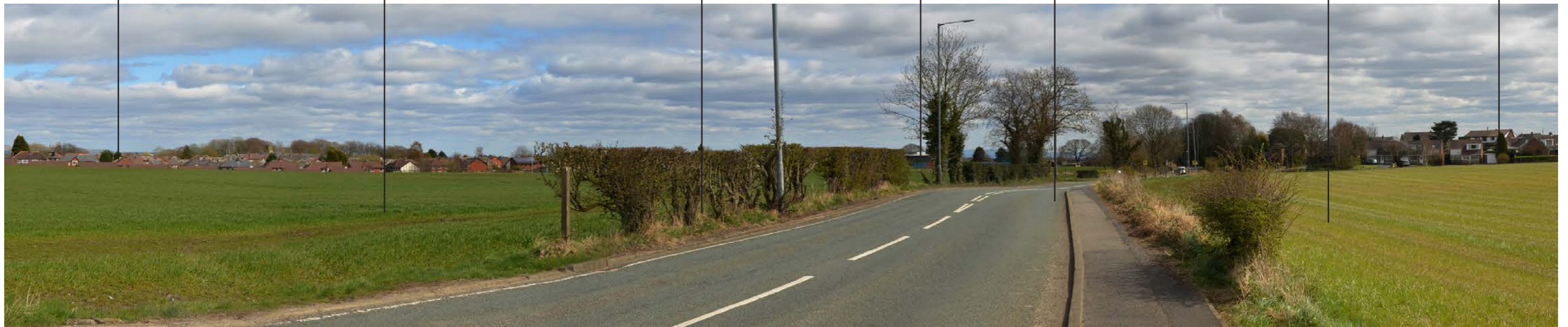
Photograph 8 continued