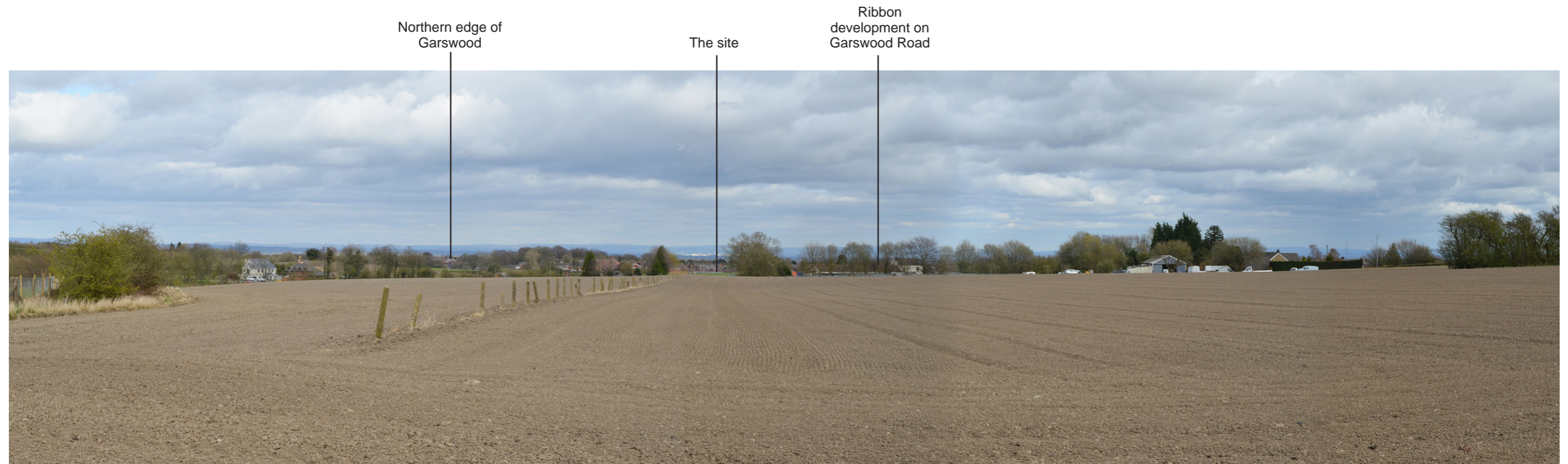
Photograph 12 - Looking east from footpath 936, to the west of the site.