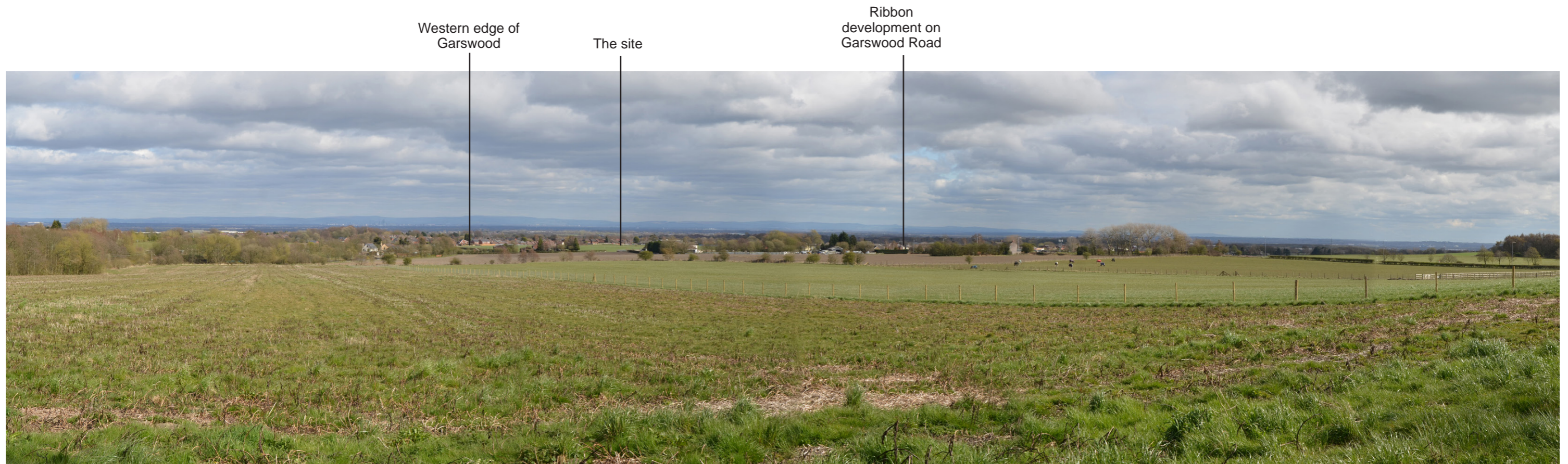
Photograph 14 - Looking east towards Garswood from footpath 86, on the high ground to the south of Barton Clough and north-west of Tatlock's Hillock.