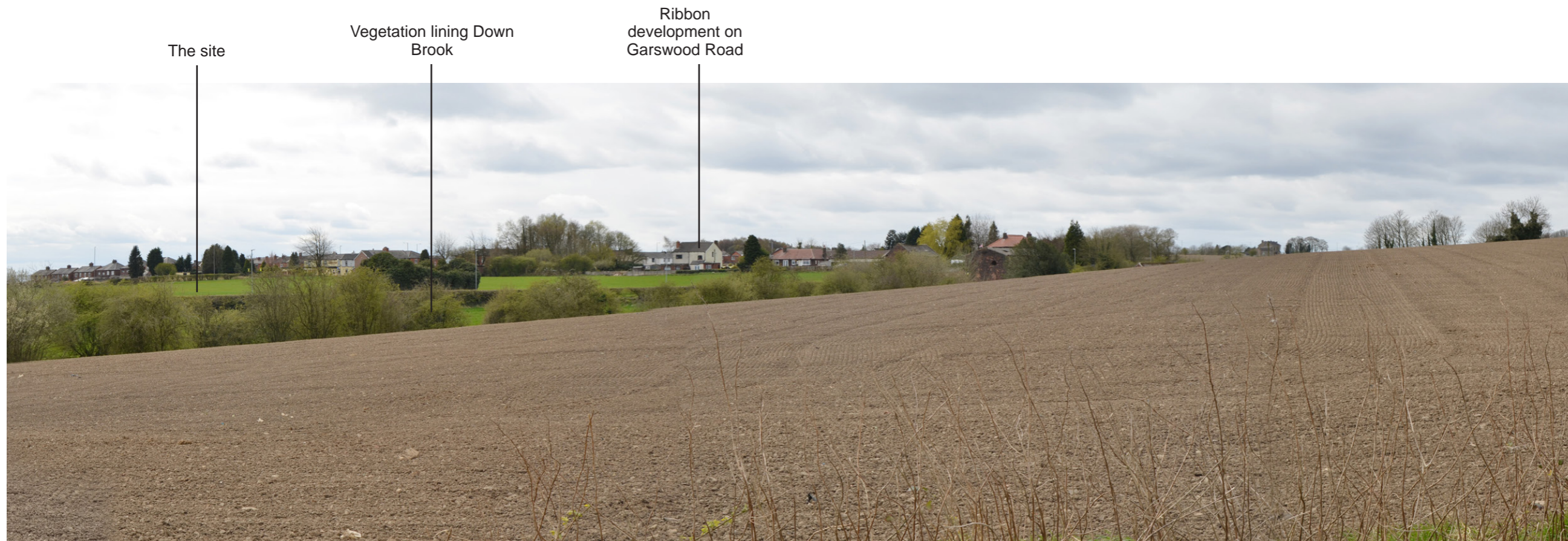
Photograph 9 continued