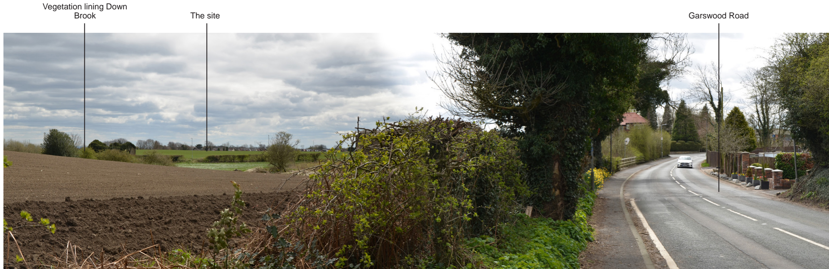
Photograph 11 - View from Garswood Road as it descends Gladden Hey Brow