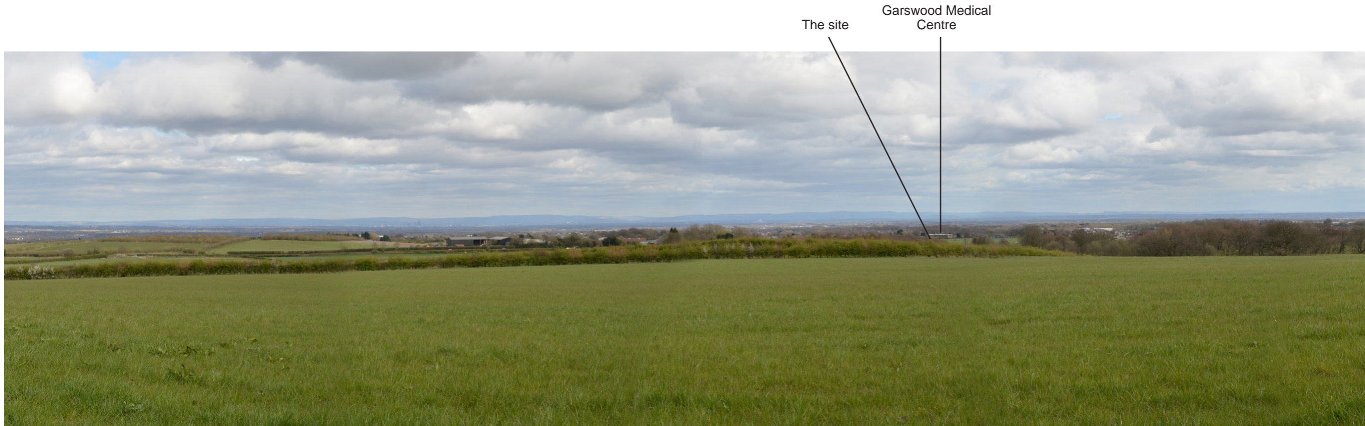
Photograph 15 - Looking south-east from Shelterbelt on hill to the east of Maddox Farm, on footpath 86. There are glimpses of the site from sections of the path. The site forms a small part of the wider view.