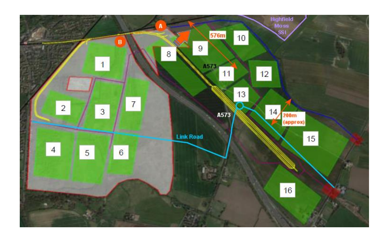
Figure 3 RFI Study 2016 Option 4 Parkside East

4.6 Option 4 is the only one in the 2016 RFI Study that target Parkside East. The schematic below shows option 4 with the PLR overlaid in light blue on the rail infrastructure topology.