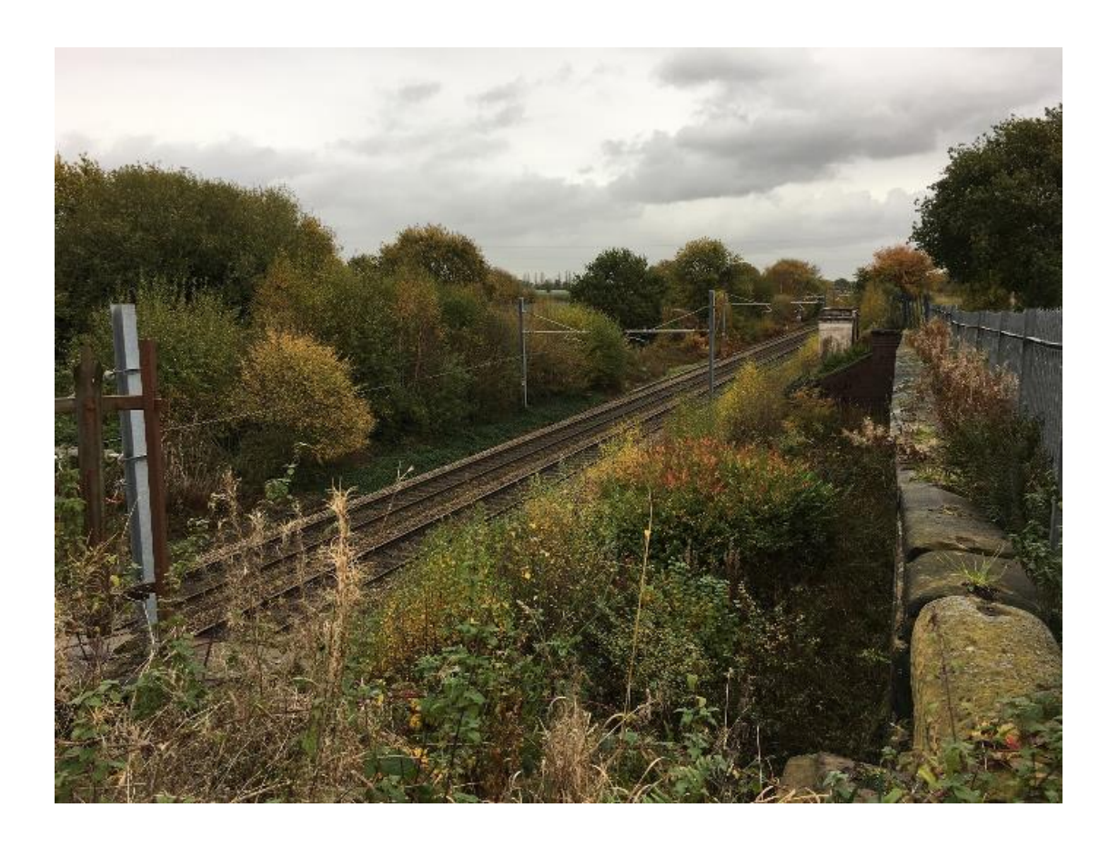
Figure 4 Parkside Road Chat Moss Line Intersection