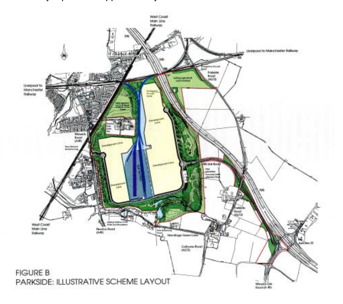
Figure 2 Rail Track 2001 Master Plan Parkside West

3.12 PAG played a neutral role at the inquiry in respect of the Green Belt position but demonstrated that an SRFI was viable without impacting Newton Park Farm as evidenced by a previous application by Rail Track in 2001 as shown below.