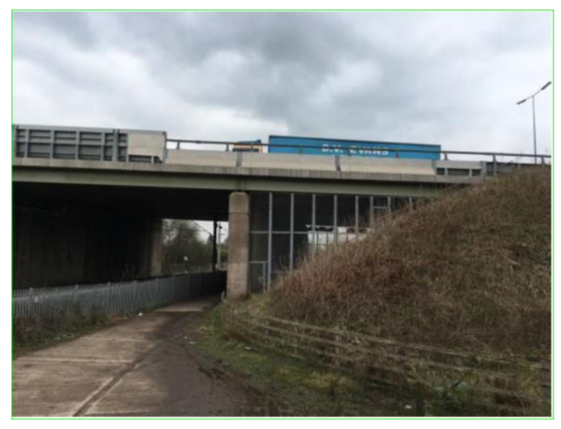
Figure 6 Access Track Running Next to Chat Moss Line

4.23 The AECOM RFI Study was written before the inception of the PLR. The document examined how road access between Parkside West and Parkside East could be facilitated. One of the options examined was the possibility of converting a track for road usage next to the Chat Moss line that passes under the M6 motorway. The picture of the track taken from the RFI Study Figure 6.2 is shown below (see Figure 3 point B):