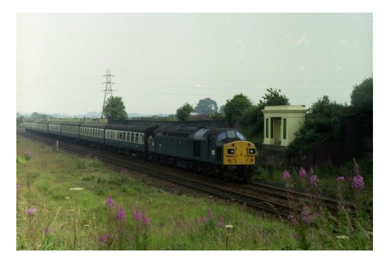
Figure 5 Train Chat Moss Adjacent to Parkside East