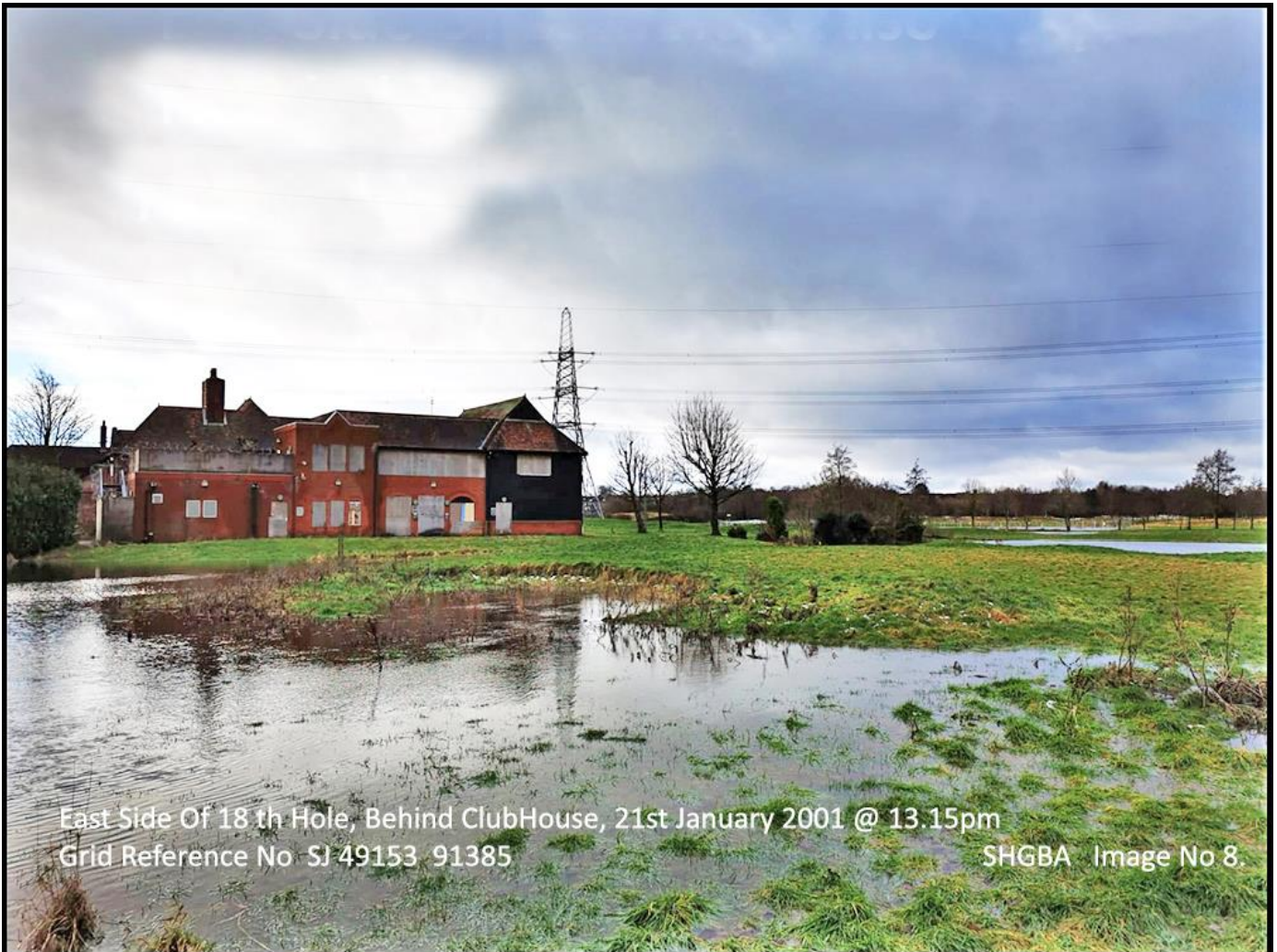
East Side Of 18 th Hole, Behind ClubHouse, 21st January 2001 @ 13.15pm Grid Reference No SJ 49153 91385 SHGBA Image No 8.