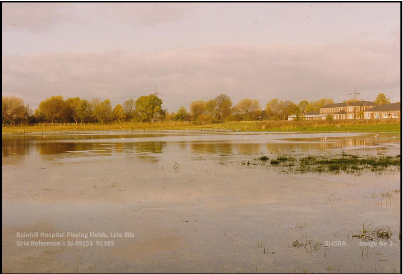
Rainhill Hospital Playing Fields, Late 80s Grid Reference = SJ 49153 91385