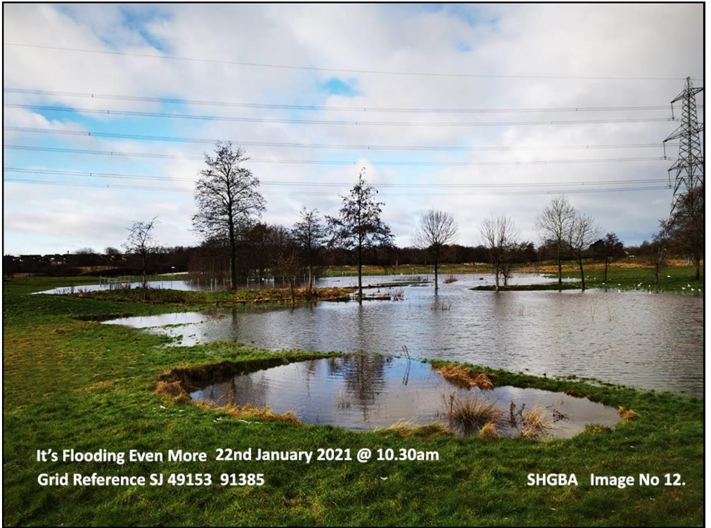
It's Flooding Even More 22nd January 2021 @ 10.30am Grid Reference SJ 49153 91385