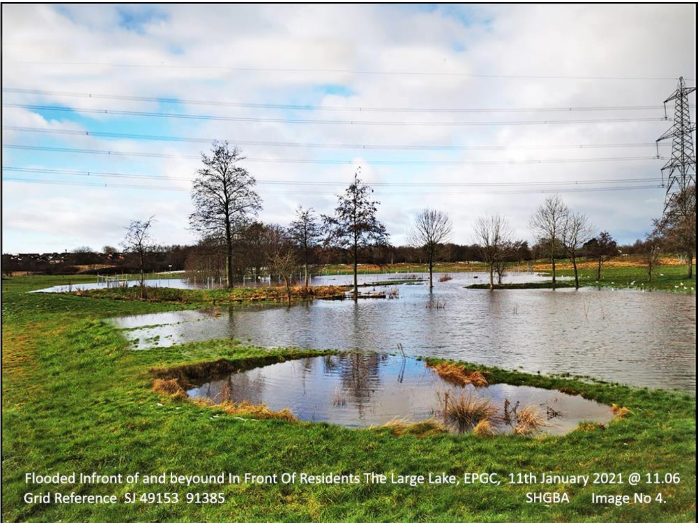
Flooded Infront of and beyond In Front Of Residents The Large Lake, EPGC, 11th January 2021 @ 11.06 Grid Reference SJ 49153 91385