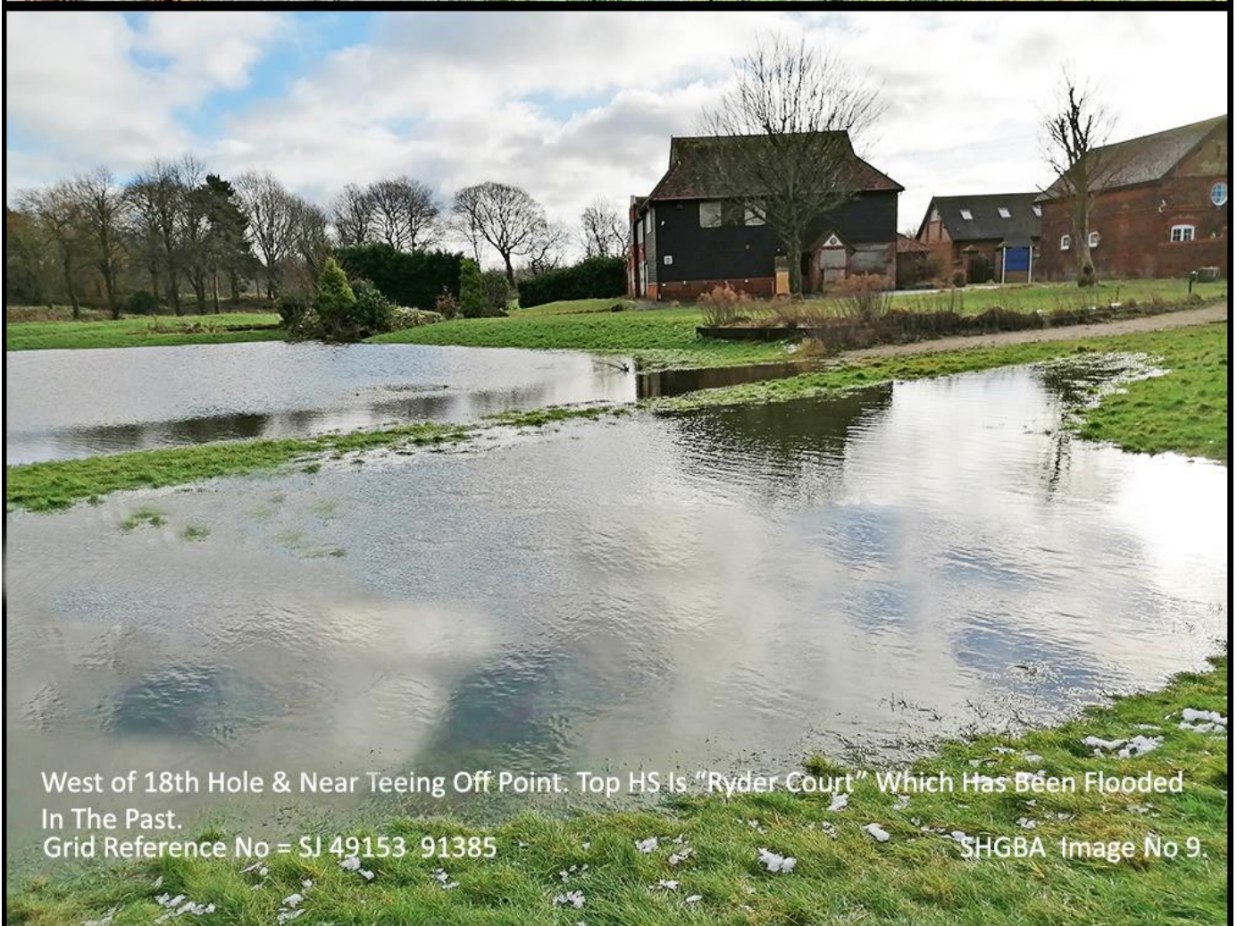
West of 18th Hole & Near Teeing Off Point. Top HS Is "Ryder Court" Which Has Been Flooded In The Past. Grid Reference No = SJ 49153 91385 SHGBA Image No 9.