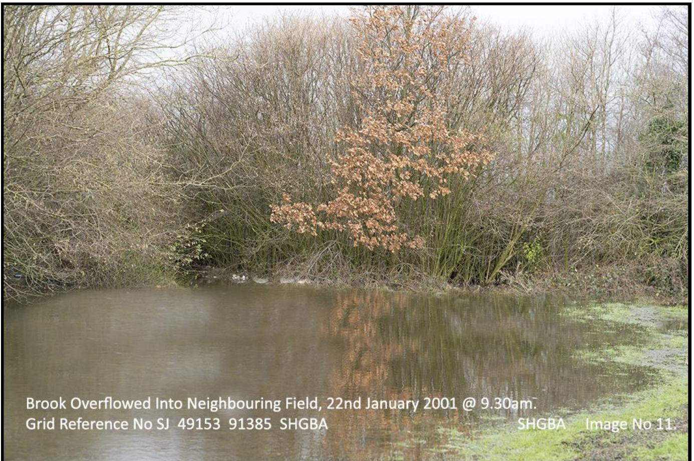
Brook Overflowed Into Neighbouring Field, 22nd January 2001 @ 9.30am. Grid Reference No SJ 49153 91385 SHGBA