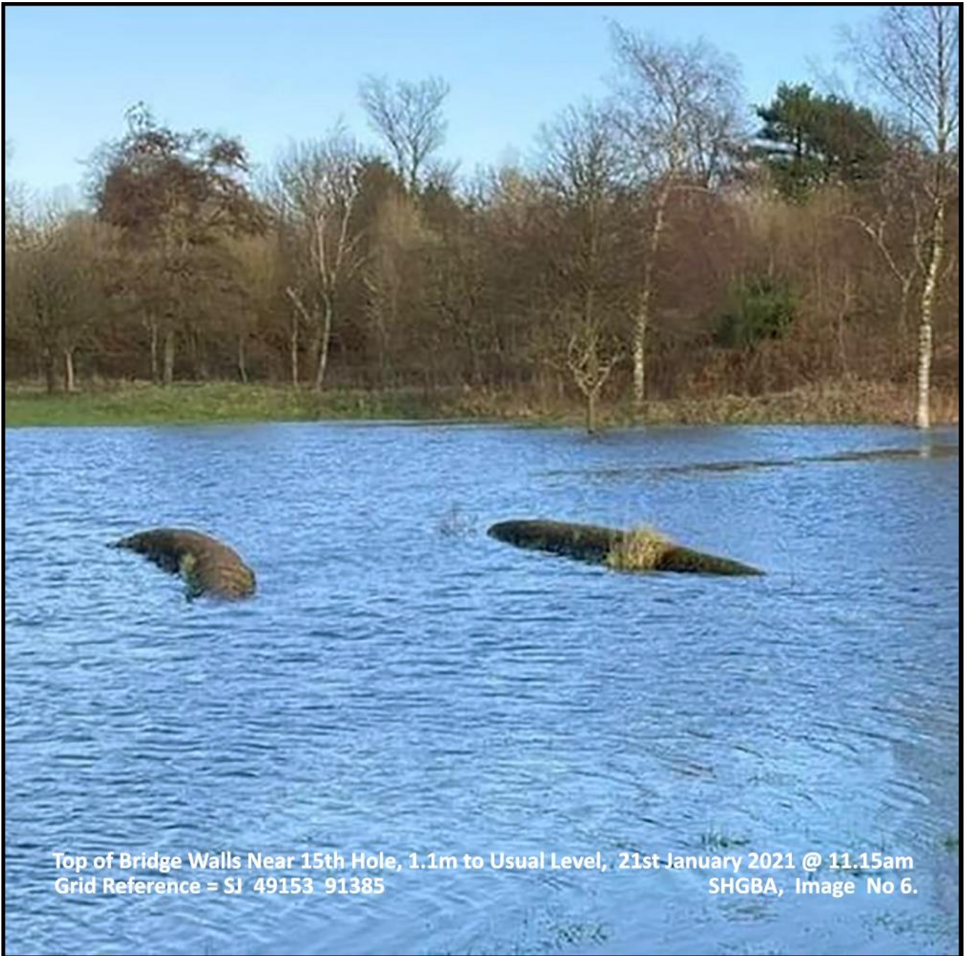
Top of Bridge Walls Near 15th Hole, 1.1m to Usual Level, 21st January 2021 @ 11.15am Grid Reference = SJ 49153 91385