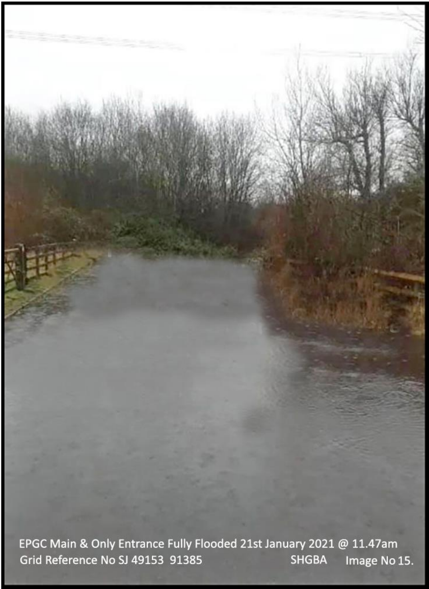
EPGC Main & Only Entrance Fully Flooded 21st January 2021 @ 11.47am Grid Reference No SJ 49153 91385 SHGBA Image No 15.