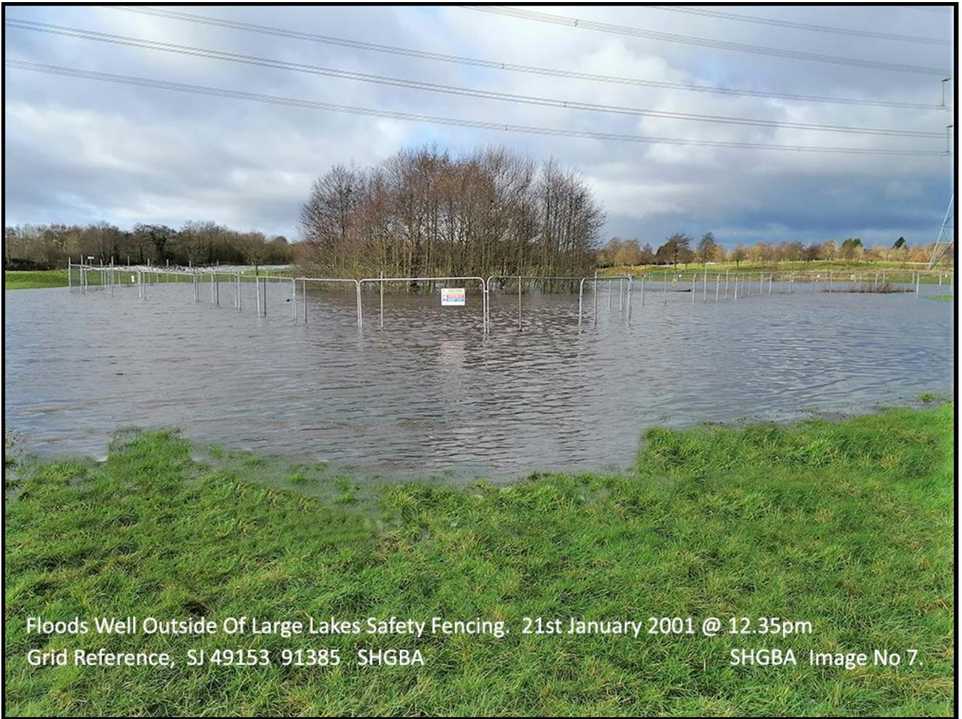
Floods Well Outside Of Large Lakes Safety Fencing. 21st January 2001 @ 12.35pm