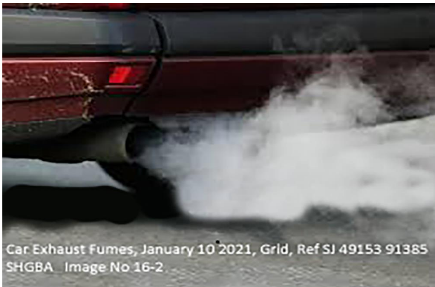
Car Exhaust Fumes, January 10 2021, Grld, Ref SJ 49153 91385 SHGBA Image No 16-2