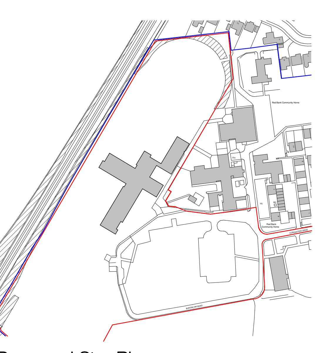
Proposed Site Plan