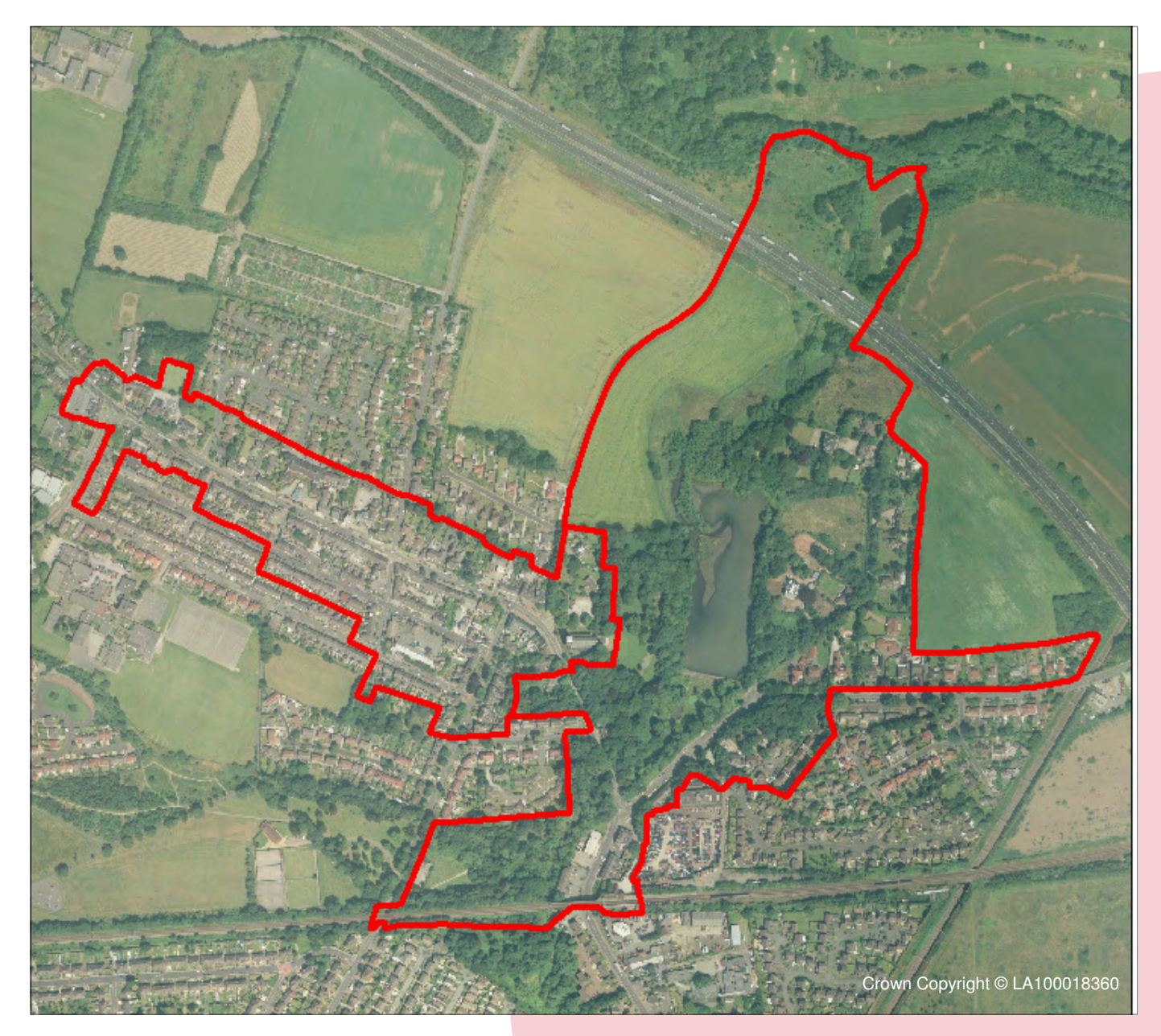
Tree cover in High Street and Willow Park Conservation Areas (as amended)

The public park known as Willow Park covers over half of the Willow Park Conservation Area. It is thickly wooded with areas of grassland, meadows and wetland, providing a variety of wildlife habitats. This wooded character is a dominant visual feature in the area, which should be respected.