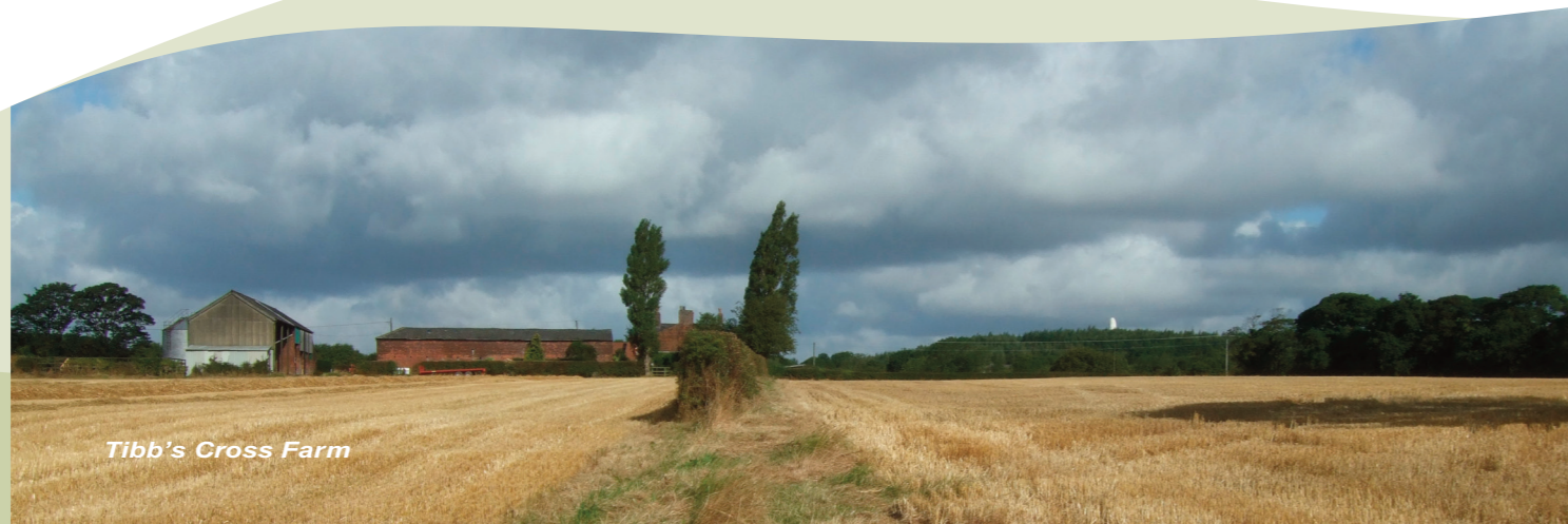
Tibb's Cross Farm

15 (10.3km) Turn left into Maypole Wood. Follow a soiled track approximately 225 metres north to a stone track, which you turn right onto. Follow this stone track east approximately 200 metres to the next junction where you turn left. Continue heading north approximately 300 metres to arrive at Gorse Lane, Point 4. Having walked 11km, cross over Gorse Lane and retrace your steps back through Points 3 & 2 to finish at St Helens Junction Railway Station (Point 1) where the total distance covered will be approximately 12.8km (8 miles).