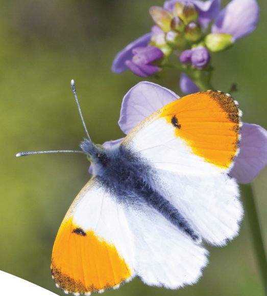
Male Orange-tip butterfly