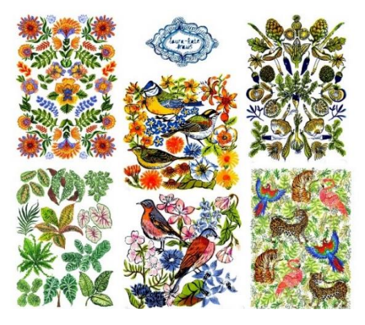
Illustration for Books

Laura-Kate explores storytelling through narrative illustration within her work and is currently looking to expand her practice into writing and illustrating picture books. She is interested in how images and words can work together to tell stories, share ideas and ignite our imaginations, as well as how picture books, comics and zines can be used to spread messages, share ideas and tackle difficult subject matter. Picture books need to work for both an adult and child audience and can become treasured pieces of art that stay with us throughout our lives.